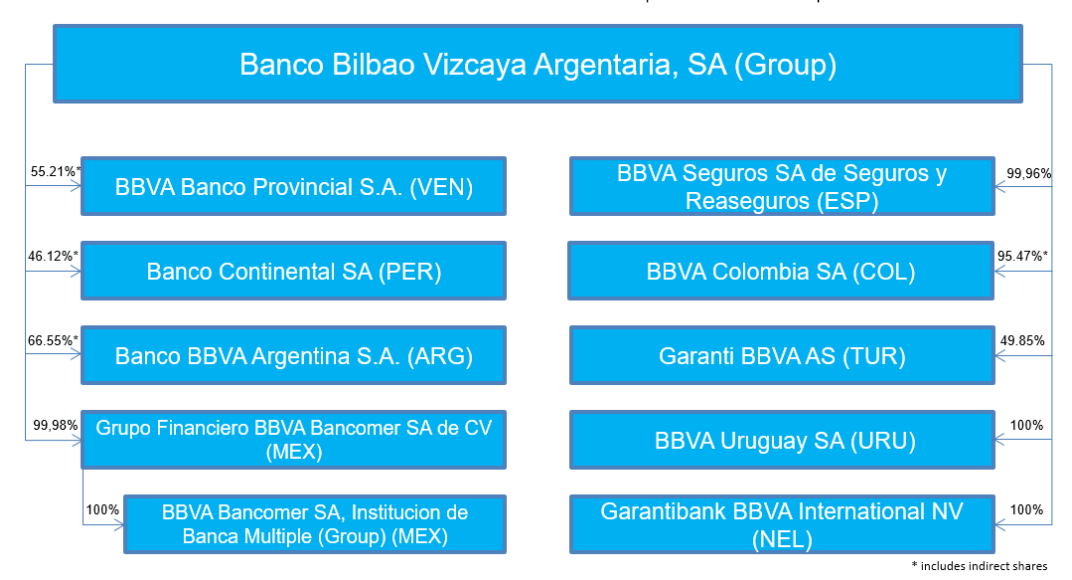
Chart 1: Main subsidiaries and investments of BBVA as of 2020 excl. USA | Source: Annual Report 2020 of BBVA

BBVA's main transactions in recent year are as follows. Closing of the sale of BBVA USA Bancshares Inc. (owns all the capital stock of BBVA USA, as well as other companies of the BBVA Group in the United States) for about 11.5 billion USD in June 2021, which leads to a positive results (net of taxes) of about €570 million. However, BBVA will continue to develop the wholesale business that it currently carries out through its branch in New York. This transaction had a positive impact on BBVA Group's CET 1 ratio of about 294bp. Moreover, BBVA sold BBVA Paraguay for approximately $250 million, which generated a capital loss, net of taxes, of approximately €9 million (closing in January 2021). In December 2020, BBVA and Allianz Group completed the founding of BBVA Allianz Seguros, which is a bancassurance joint venture in order to develop the non-life insurance business in Spain and of which Allianz Group has acquired 50% plus one share. BBVA Seguros received a total of approximately €274 million for the sale of this stake. The sale of BBVA Chile to the Scotiabank in 2018 generated a capital gain of about €633 million, net of taxes.